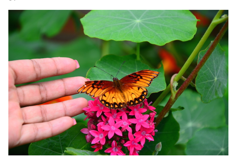
Day 3: BL

Our first stop is the impressive Quindío Botanical Garden in Calarcá where you'll take a guided tour to learn about Colombia's biodiversity. After the tour, become a coffee expert, learning about the coffee cultivation process from seed to cup while immersing yourself in the colorful Paisa culture.